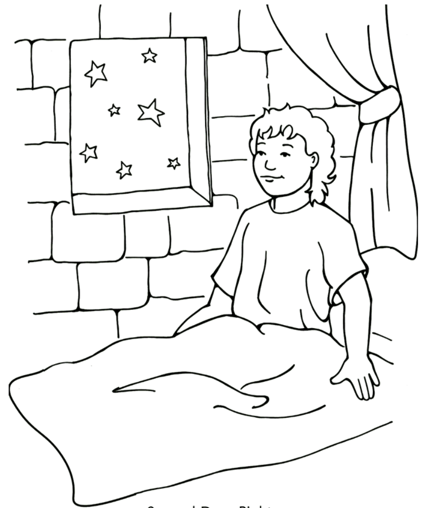
Samuel Does Right 1 Samuel 2-4, 7